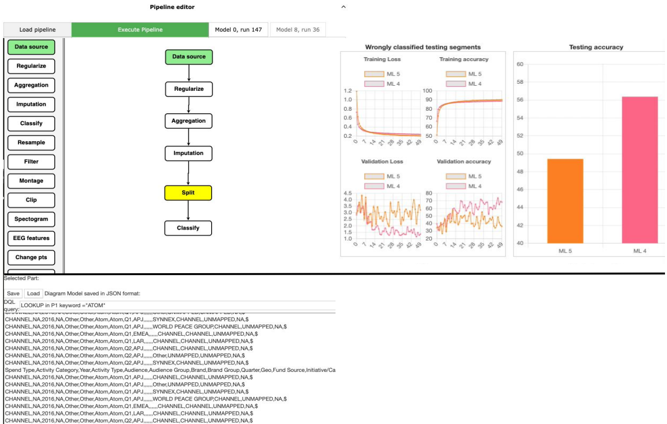
Figure 3: Dagger User Interface. Upper-left: Pipeline editor. Upper-right: ML performance charts. Bottom: Dagger console

Finding similar data points: Lou often notices data points at different stages of the pipeline that are worth inspecting, e.g., outliers and errors. To inspect those points further, Lou first needs to find other data points that are similar to them. Additionally, given a new batch of records for a new customer, Lou would need to decide which pipeline would fit this data best (assuming Lou has a list of K pipelines dealing with different customers' data). Which pipeline is best for new data? Lou already has a list of K pipelines dealing with different classes of customers (e.g., a pipeline handling customer data pulled from a legacy HR system requires different modules than one handling customer data with a current HR system). When a new batch of records for a new customer comes in, Lou needs to quickly tell which of the K pipelines has input data that is most similar to the incoming data. The similarity functions are defined by Lou for the different attributes of the tables.